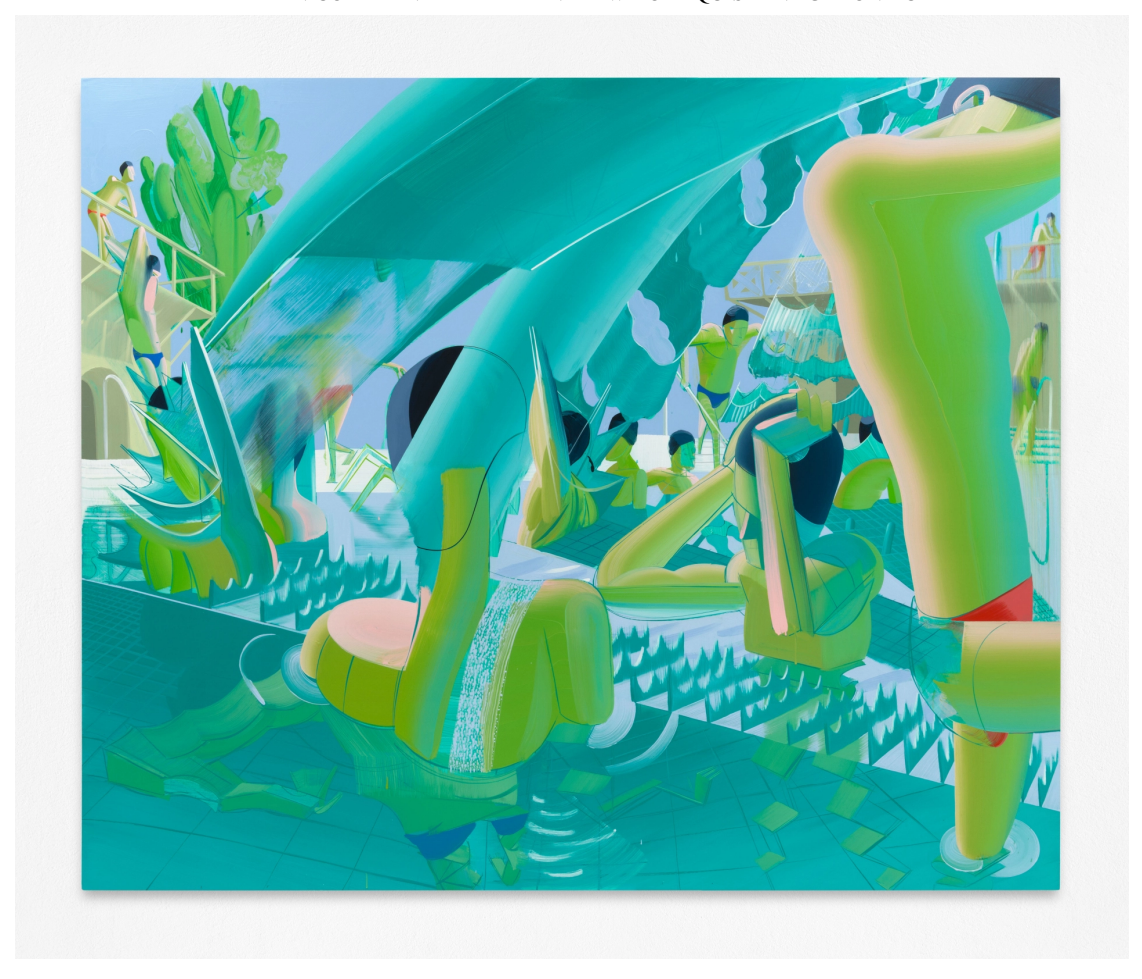
Bathers, oil and acrylic on canvas, 94.5 x 78.75 in, 2016