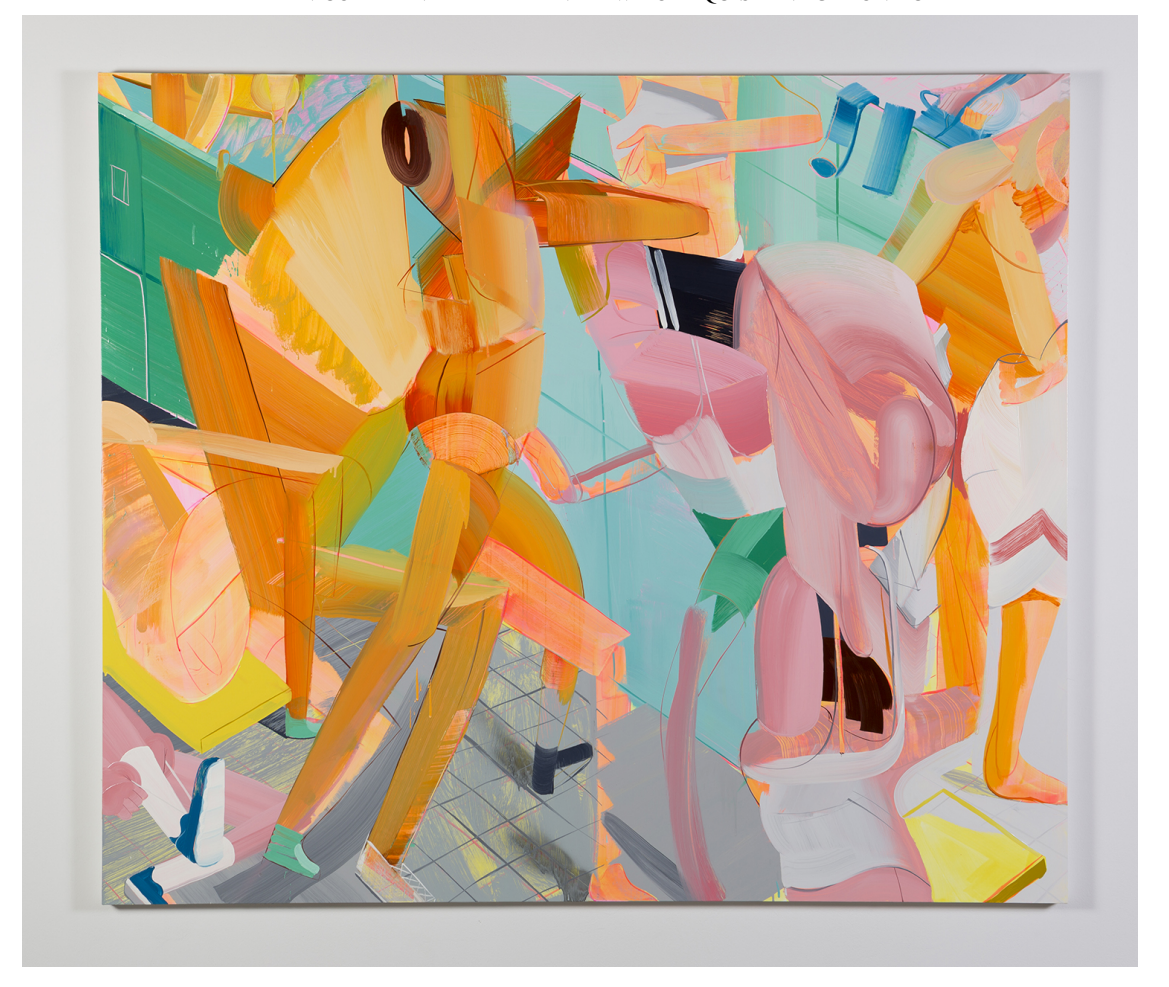
Locker Room, oil and acrylic on canvas, 84 x 72 in, 2015