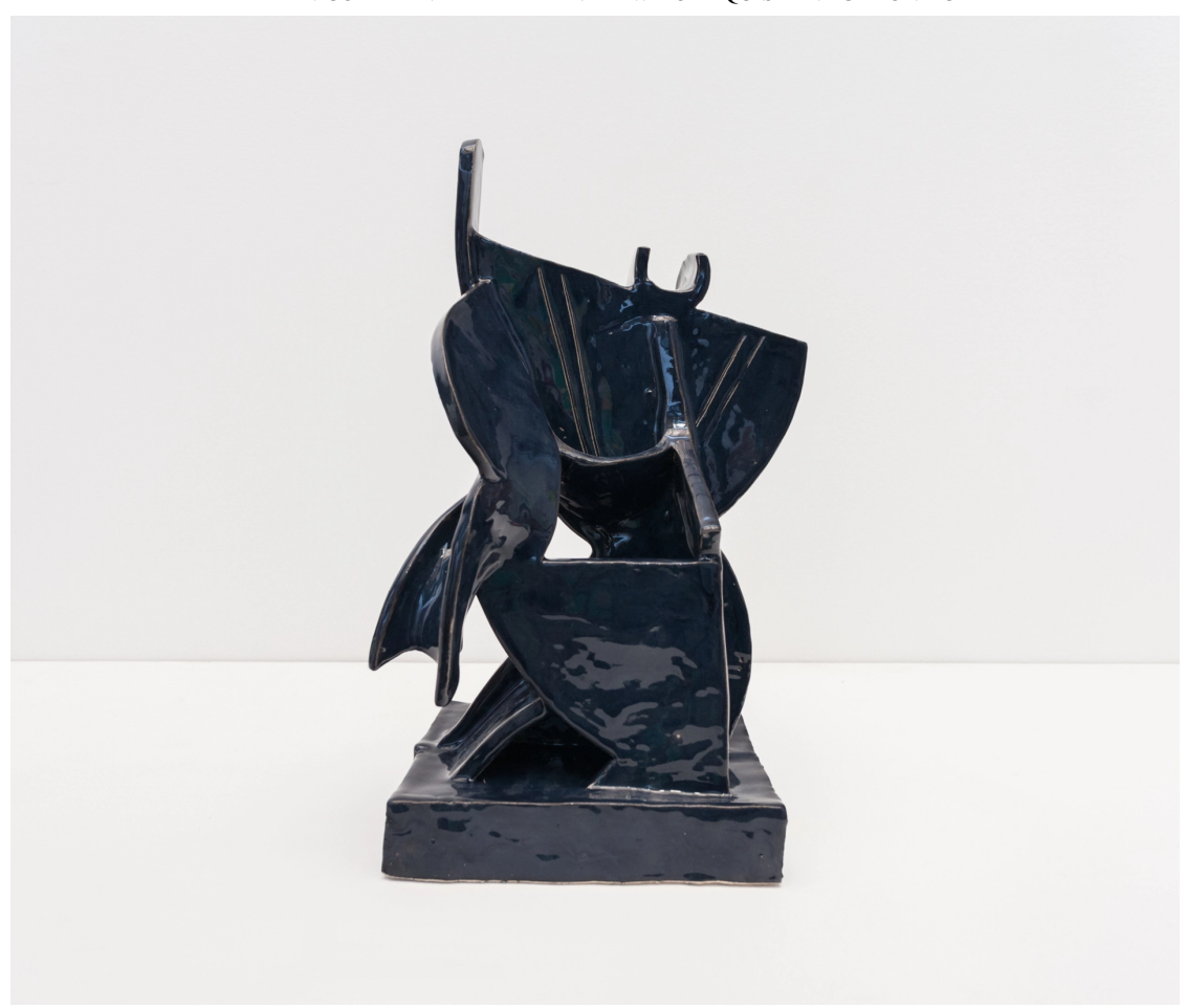
Contortionist, glazed ceramic, 15.5h x 11w x 9d in, 2016