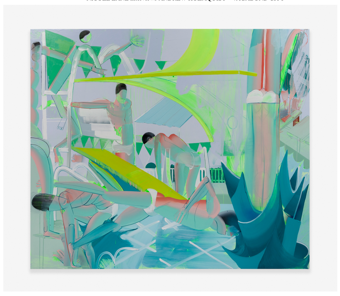
Swim Meet, oil and acrylic on canvas, 84 x 72 in, 2015