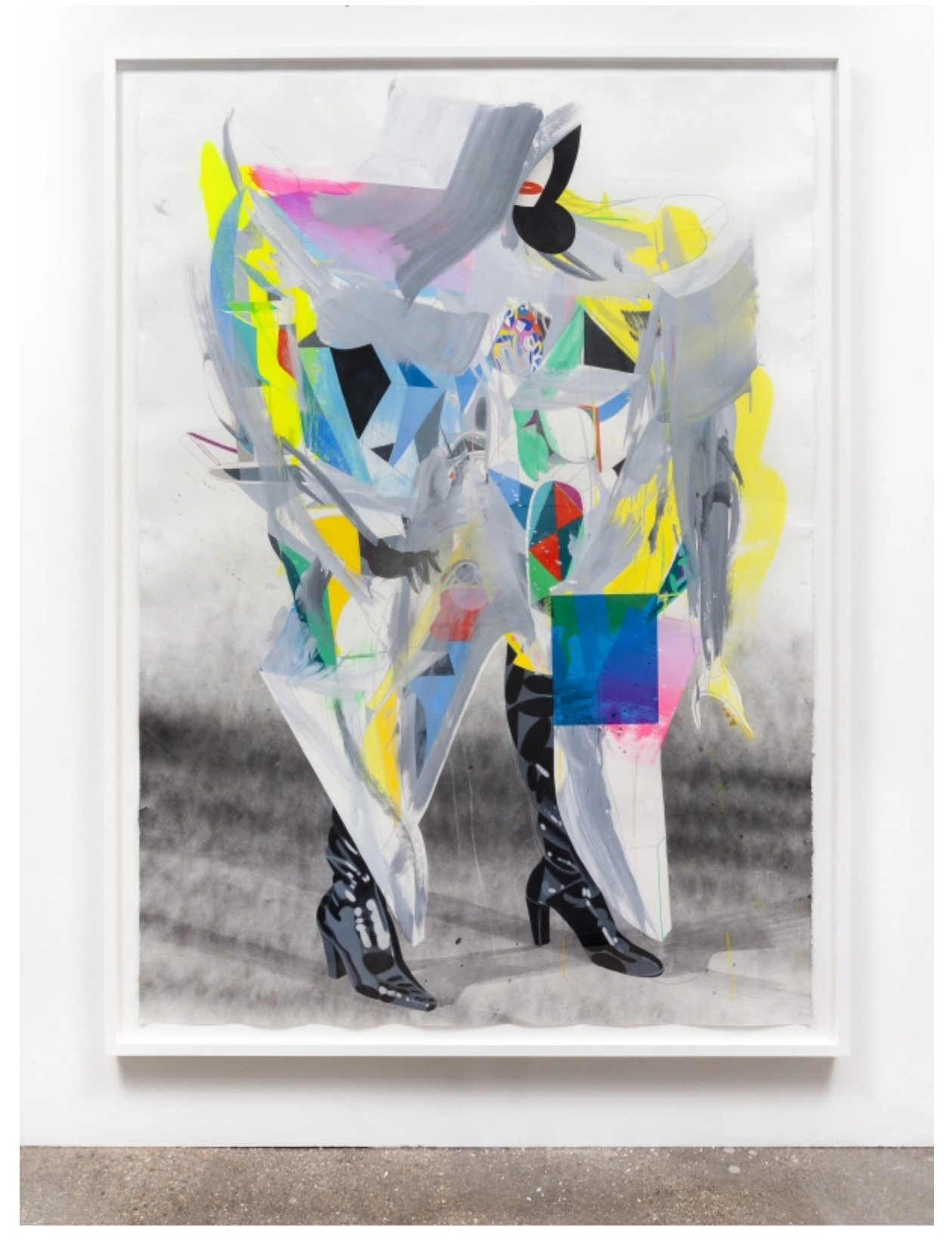
Strong LQQk (Queen), colored pencil, gouache, spray paint and collage on paper, 55 \, x 77 in, 2017

Can you discuss your studio practice and how you confront your projects?