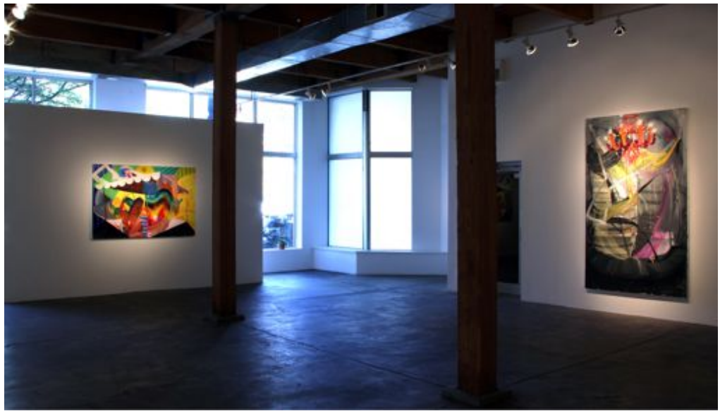
Installation view at Carrie Secrist Gallery, Chicago